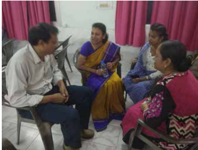
A group in session during the conference