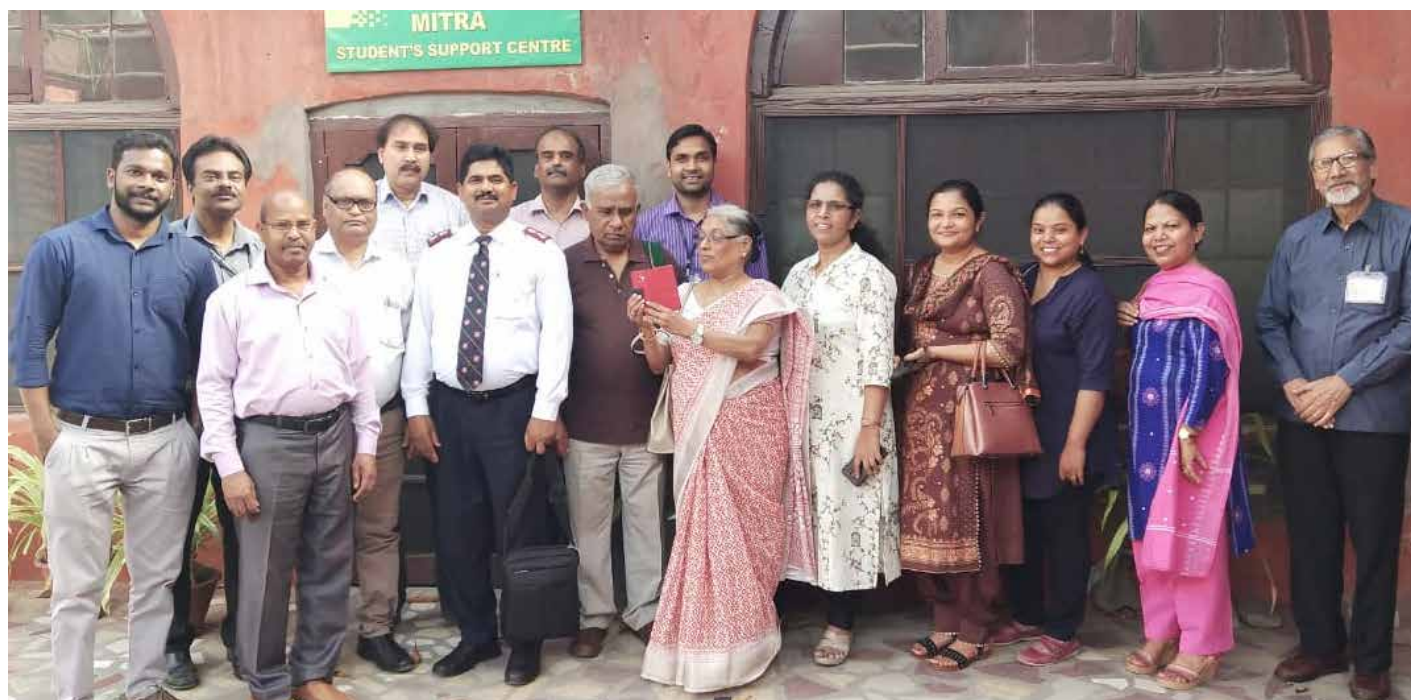
Local Committee Meeting of North West Region, at CMC Ludhiana.

Join the virtual classroom as Guest. Write your name, or the institution's name in case you are joining as a group. Use the chat box to comment or ask questions.