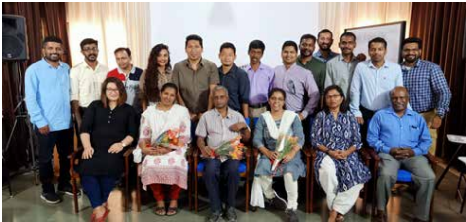
RFs with senior officials of CMAI at a meeting in Bangalore in May 2019